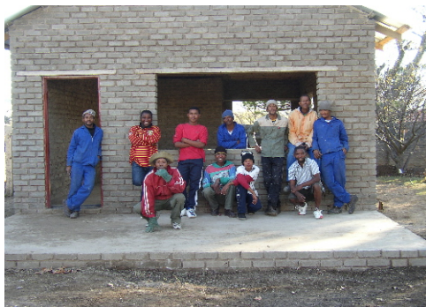
The Construction Team

The construction team has been doing a great job, showing real spirit, commitment and pride in their work. We have twice daily site meetings and the teamwork has developed over the weeks and been really fantastic to see.