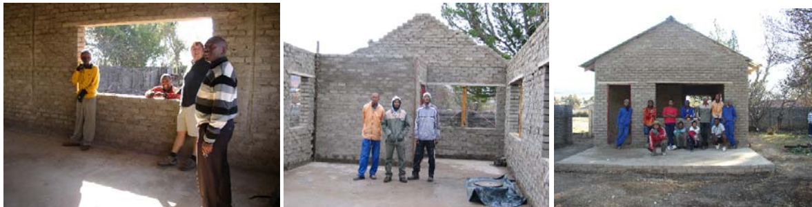
Inside, before and after - our new roof!

The only issue we face at the moment is with the Senqu local municipality. There is currently no-one employed as a building inspector or in the planning office. Thing should be rectified soon.