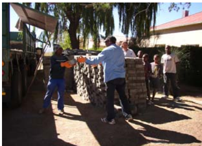
Moving the bricks on to the site

After a few battles with transport we have finally got all our materials on site.