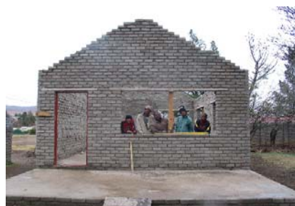
A room with a view